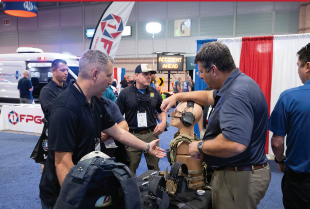
EXHIBIT SPACE PAYMENT: